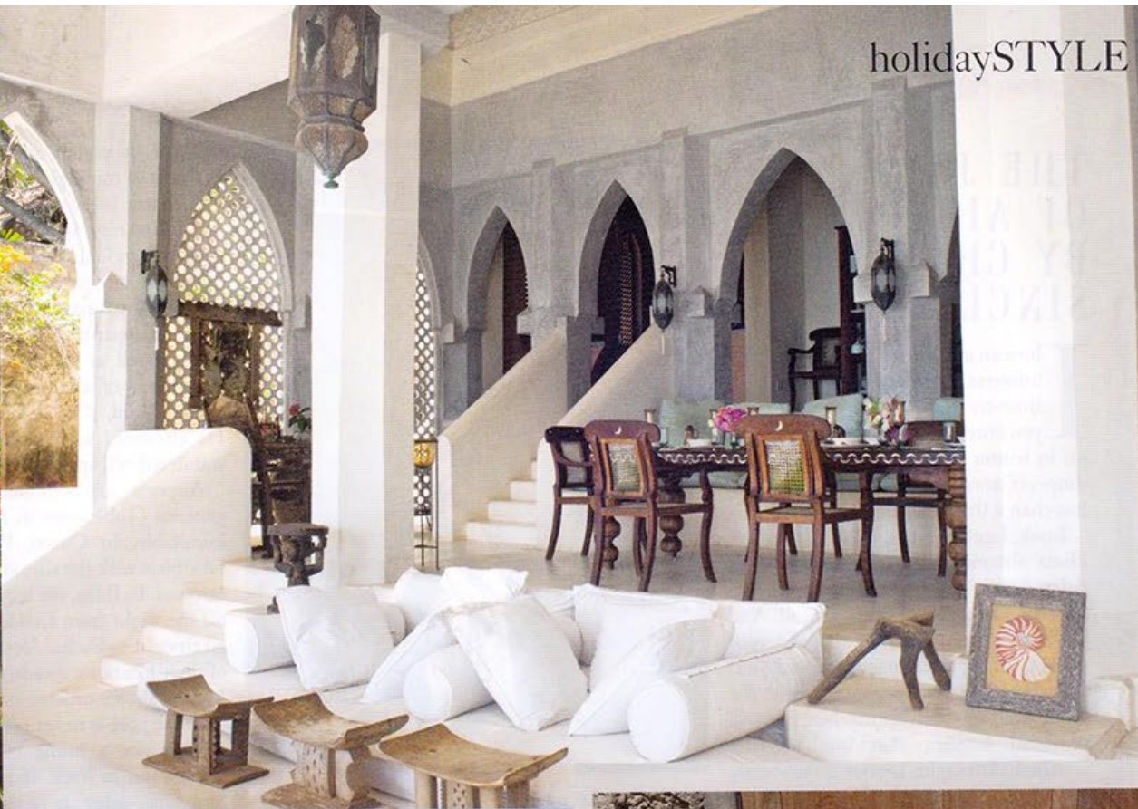
This page: the house's terrace (above and bottom right); scenes from Lamu life